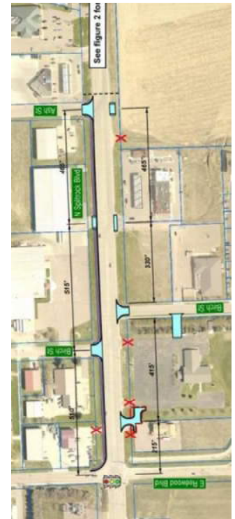
Splitrock Blvd (South of Interchange)